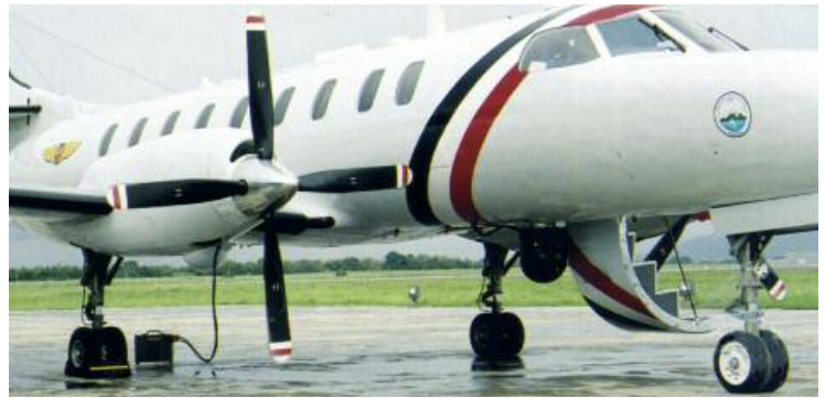
GPU 1500/40: Swearingen Metroliner with Garrett TPE331 turbines, Trinidad

With Brazil operating more than 100 units, Canadian forces more than 60 units and with multiple units in operation with many armed forces and civil operators, the 1500/40 is recognised worldwide for its versatility and performance. Thousands of 1500/40 GPUs power the helicopters of SAR, HEMS, off-shore operators and the airborne law enforcement helicopters.