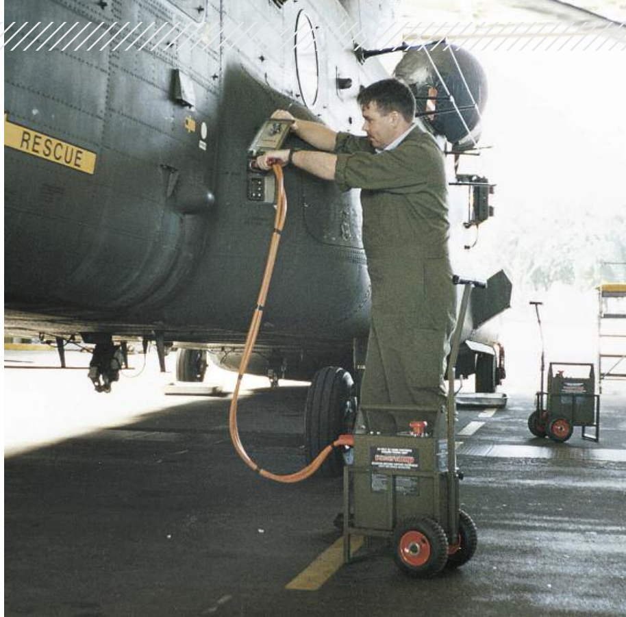
GPU 1500: Chinook line maintenance

Typical power plant:* PT6A-27, TFE 331, Arriel, Williams FJ33, GE H80