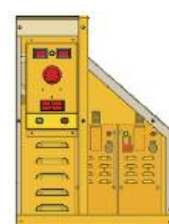
GPU Coolspool 58