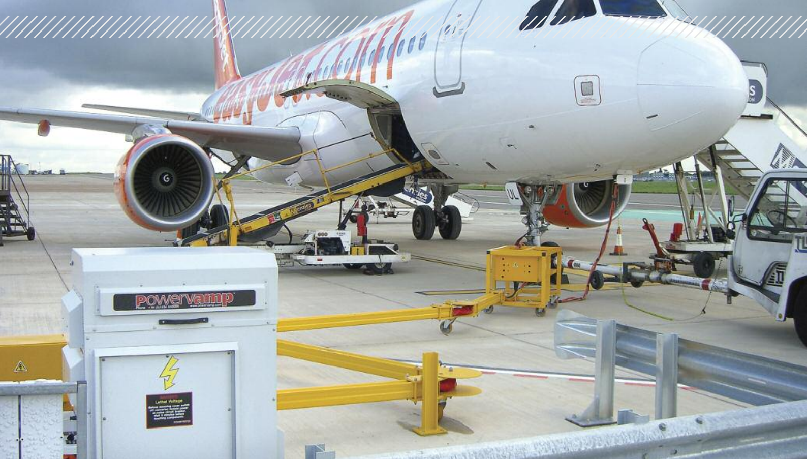
One of a batch of 90 kVA converters installed at Bristol airport