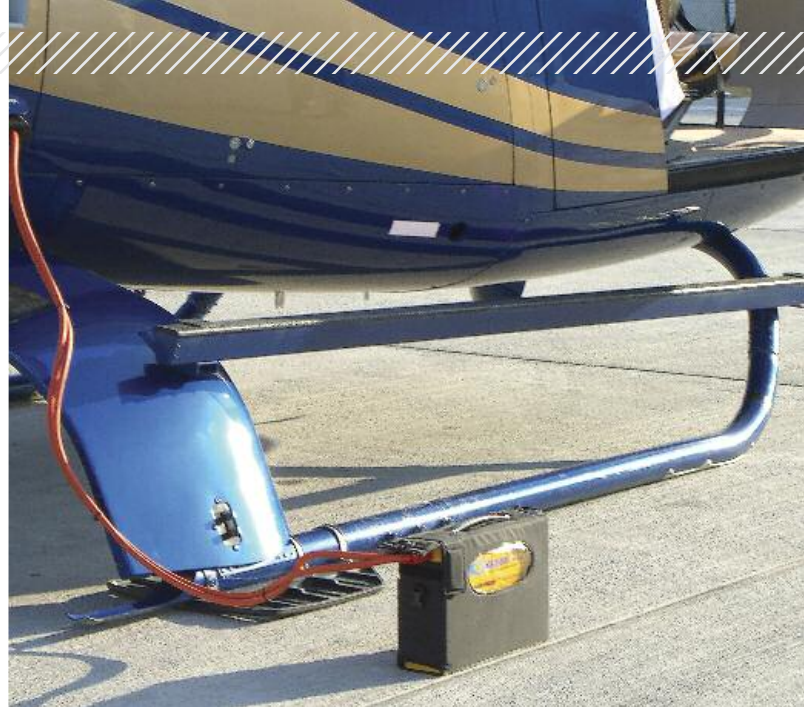
Coolspool 17: EC130 preflight and start

Typical power plant:* Arrius 2F, Rolls-Royce 250